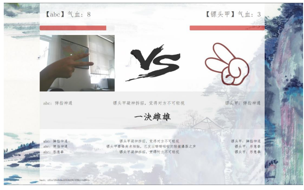
Figure 3: The UI design for the game

To illustrate our results, a web-based game is designed with the interface shown in Figure 3. The player can start a round by pressing the button in the middle, which will be followed by a countdown gif showing the remaining time on the top. When the countdown is finished, the camera will capture a photo (as shown on the left-hand side) and the result will appear in the bottom. However, we identify some problematic issues during the implementation of the game. These issues will be discussed in the following subsections.