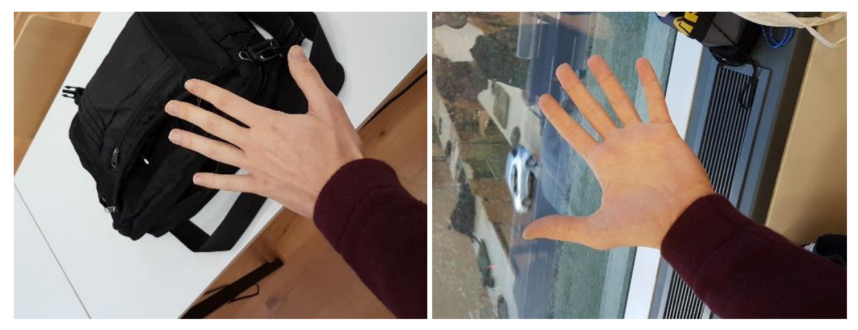
Figure 2: the same hand under different backgrounds (alish_manandhar, 2019)